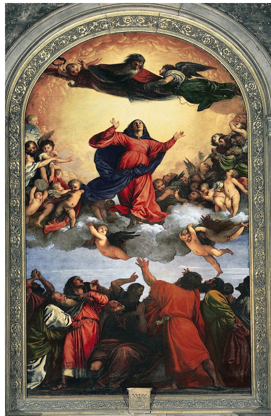
Assumption of the Blessed Virgin Mary